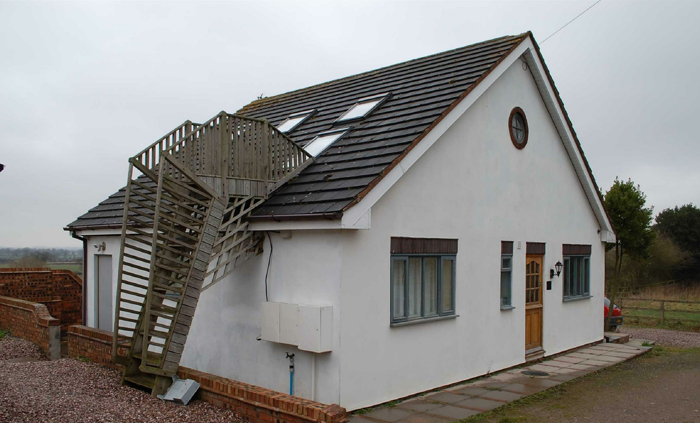
Upper Coach House, Bishops Wood, Stafford, South Staffordshire, ST19 9AF